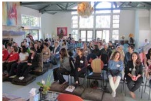
Meeting at Stillheart Retreat Centre